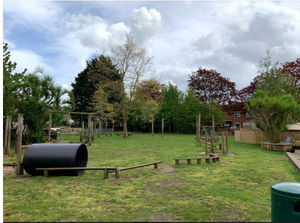
Here is a picture of our outdoor area.

In Year One, your child will be eating in the dining hall. The children will be taught to be independent whilst supported by our midday supervisors.