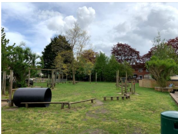
Here is a picture of our outdoor area

In Year One, your child will be eating in the dining hall. The children will be taught to be independent whilst supported by our midday supervisors.