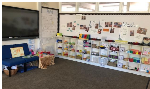
Here is a photo of the provision in Oak class.